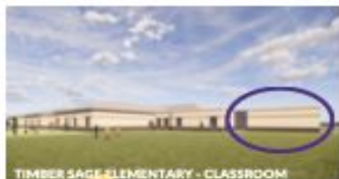
TIMBER SAGE ELEMENTARY - CLASSROOM