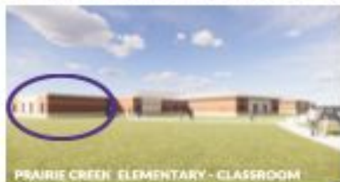
PRAIRIE CREEK ELEMENTARY - CLASSROOM