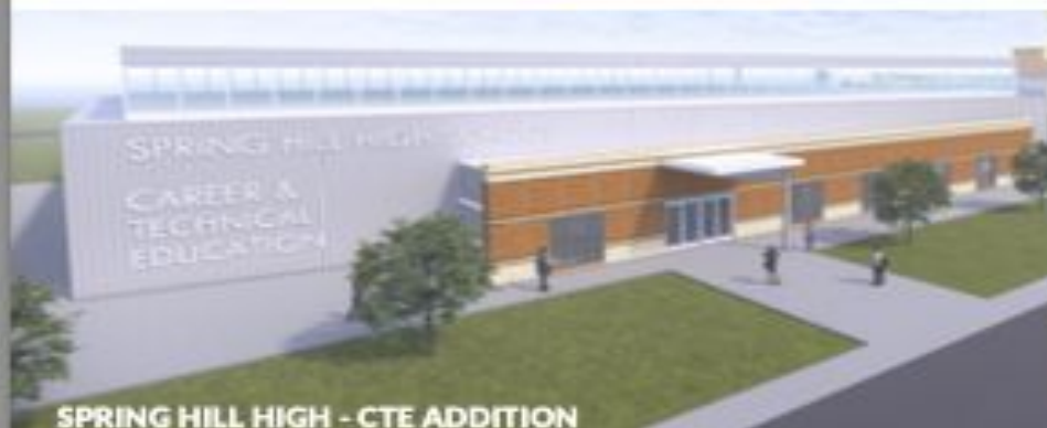
SPRING HILL HIGH - CTE ADDITION