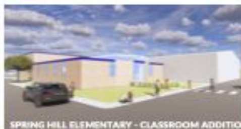
SPRING HILL ELEMENTARY - CLASSROOM ADDITION