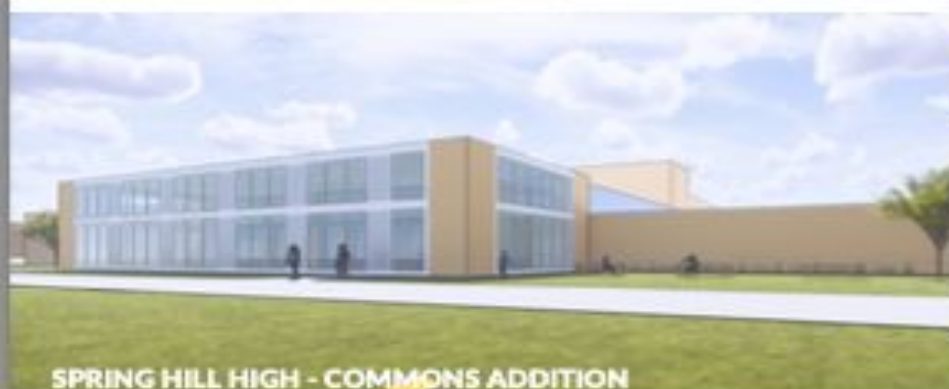
SPRING HILL HIGH - COMMONS ADDITION