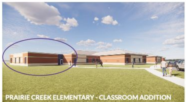
PRAIRIE CREEK ELEMENTARY - CLASSROOM ADDITION

Rendering is for illustration only. The design will be developed with staff and community input.