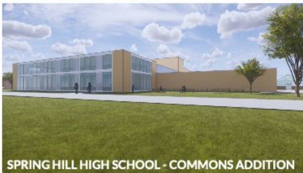
SPRING HILL HIGH SCHOOL - COMMONS ADDITION