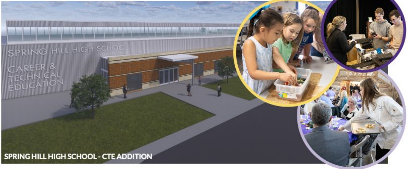
SPRING HILL HIGH SCHOOL - CTE ADDITION