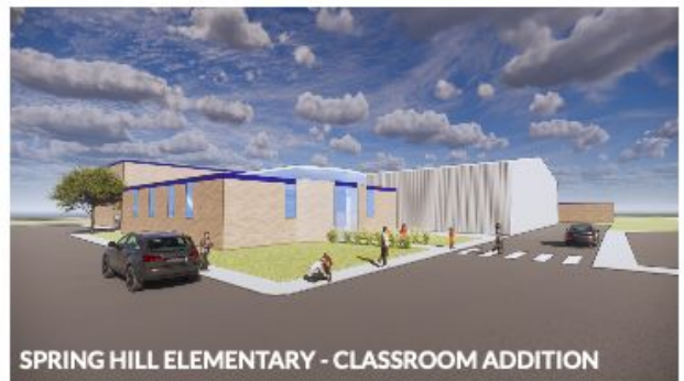
SPRING HILL ELEMENTARY - CLASSROOM ADDITION