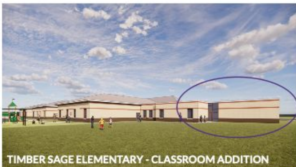
TIMBER SAGE ELEMENTARY - CLASSROOM ADDITION